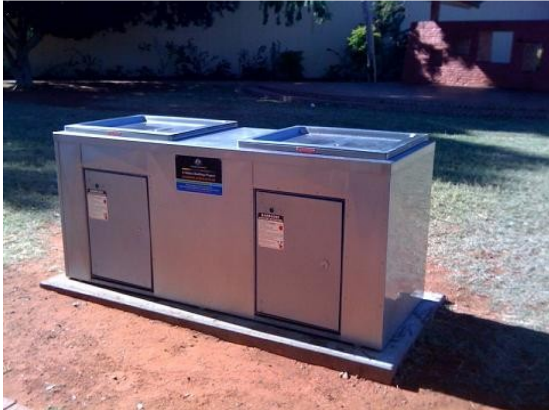
Model shown: DCSS6 with Kingsize Electric BBQs

Installation is easy with a pre-fabricated cabinet. Simply unpack, bolt down and connect up.