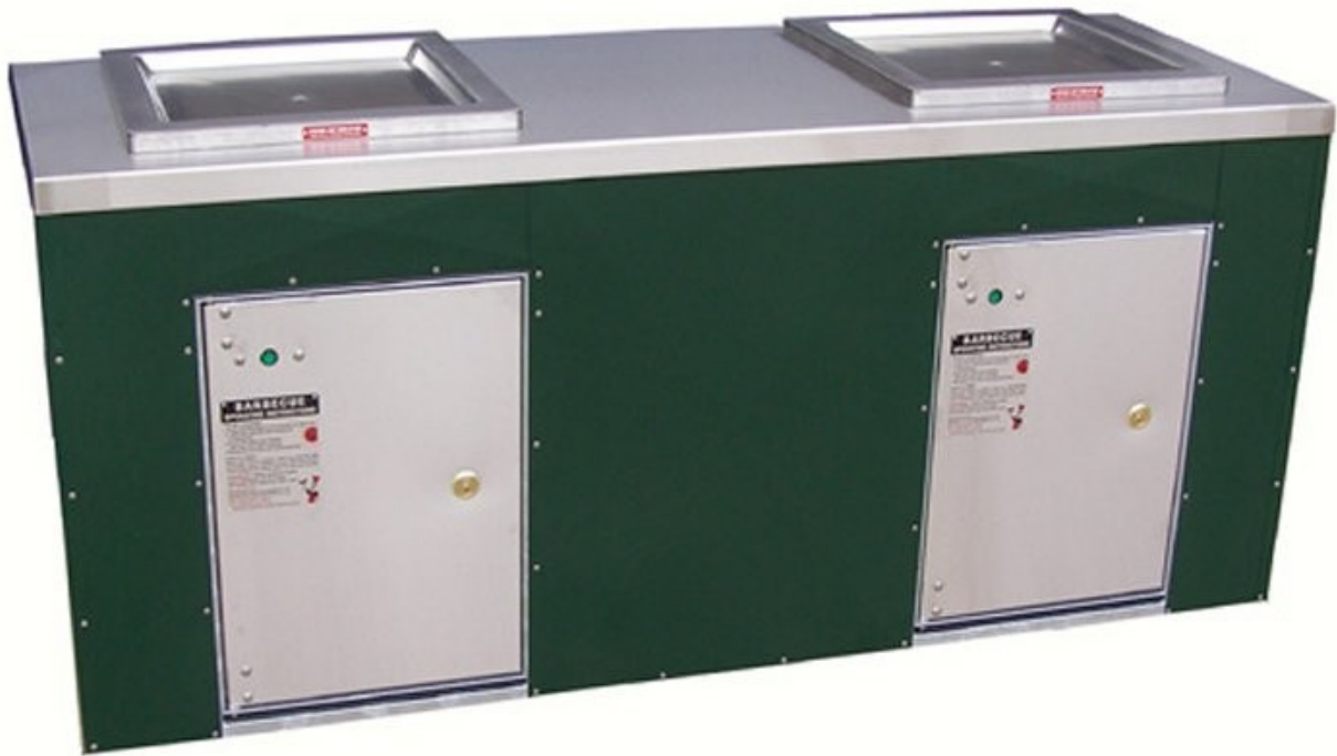
Model shown: DCPC23 with Queensize Electric BBQs, Hawthorne Green

Installation is easy with a pre-fabricated cabinet. Simply unpack, bolt down and connect up.