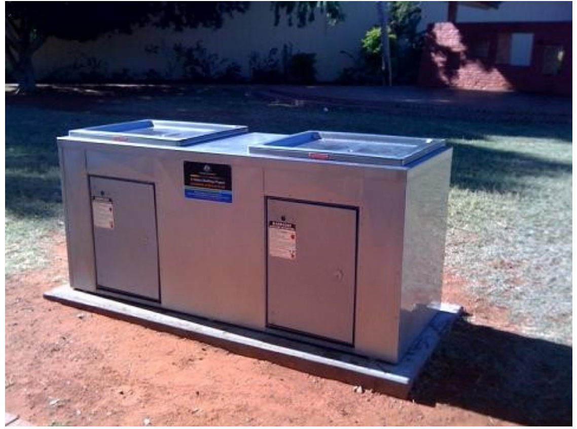
Model shown: DCSS6 with Kingsize Electric BBQs

Installation is easy with a pre-fabricated cabinet. Simply unpack, bolt down and connect up.